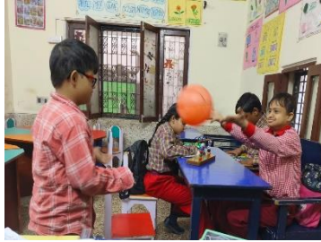
Passing the Ball Game