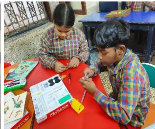
Assembling Kit Activity