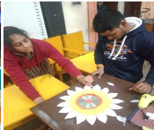
Art / Craft Activity