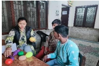
Speech Therapy Sessions