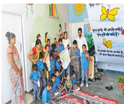
Hand Painting Activity