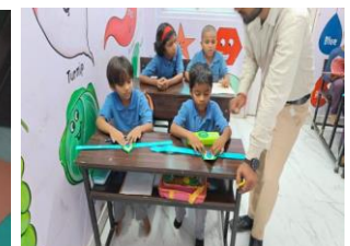
Art & Craft activity