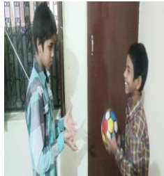
Ball Catch & Throw

Jyoti Kiran School intervention continued in collaboration with the State Bank of India Foundation. It includes education, physiotherapy, occupational therapy, and speech therapy sessions.