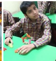
Putting beads in thread