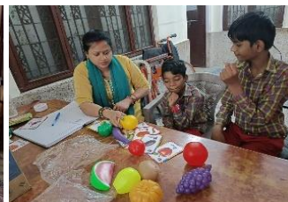
Speech Therapy Sessions