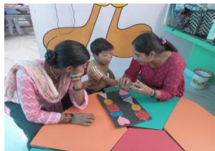
Shape Identification Activity Matching Concept

SPARC-India, supported by IDFC FIRST Bank, continued the Ek Prayas Centre on early identification and intervention to support the physical and mental development of children aged 1 to 14 years with Children with Intellectual Disabilities, Cerebral Palsy, Down Syndrome, and Autism Spectrum Disorder (ASD). The sessions included education, physiotherapy, and speech therapy.