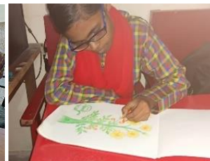
Art / Craft Activity