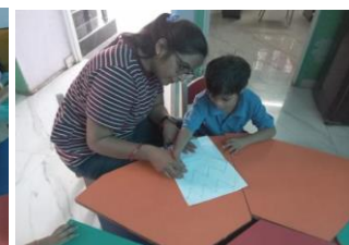
Tracing Pattern Activity