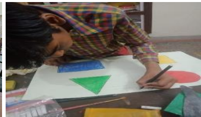
Art / Craft Activity