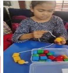
Putting beats in rope