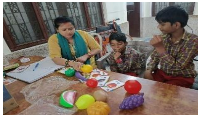
Speech Therapy Sessions