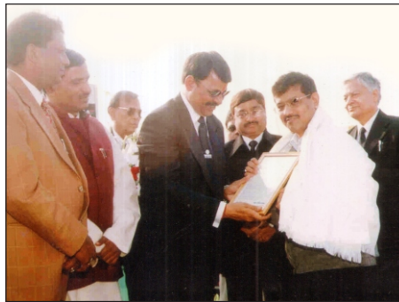
Sahara Welfare Award 2003