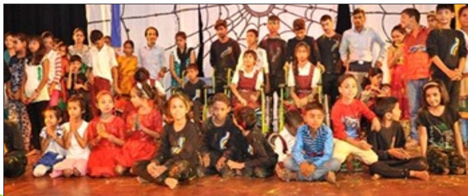
Valedictory Function on 9 th June 2016