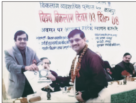
VRC Award 2008