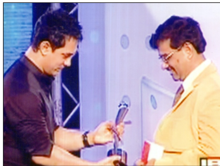
Super Idol Award 2010 (IBN7 News channel)