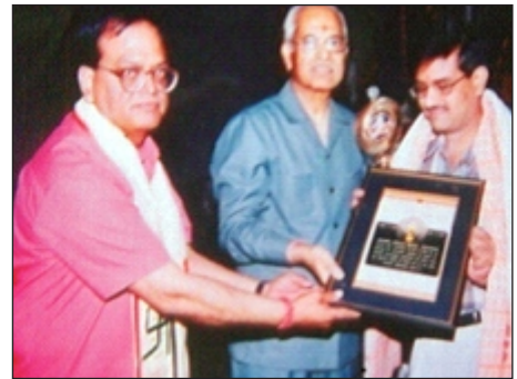
J.B. Charitable Awards 2005