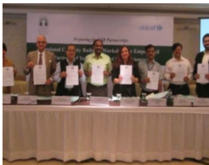
3 rd Regional Capacity building workshop for Empanelled Partners of Tata Institute of Social Sciences