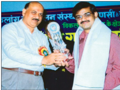
Rajiv Gandhi Award 2006