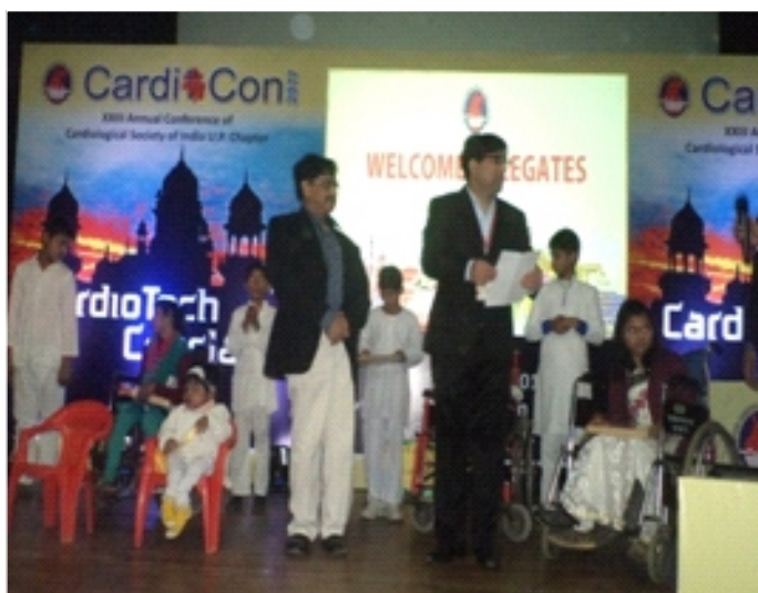
CARDICON 2017, XXIII rd Annual Conference of Cardiological Society of India U.P.