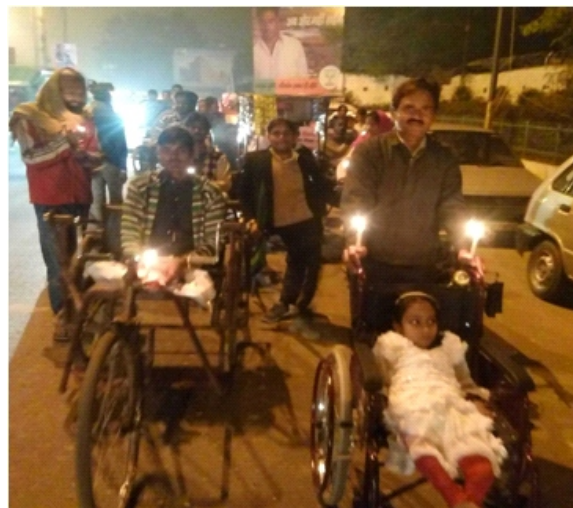
Candle March on 3 rd December 2016