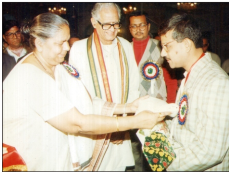
State Award 2001