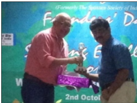
Excellence in Activism Award 2014